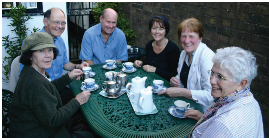
Stopping for lunch and discussion.