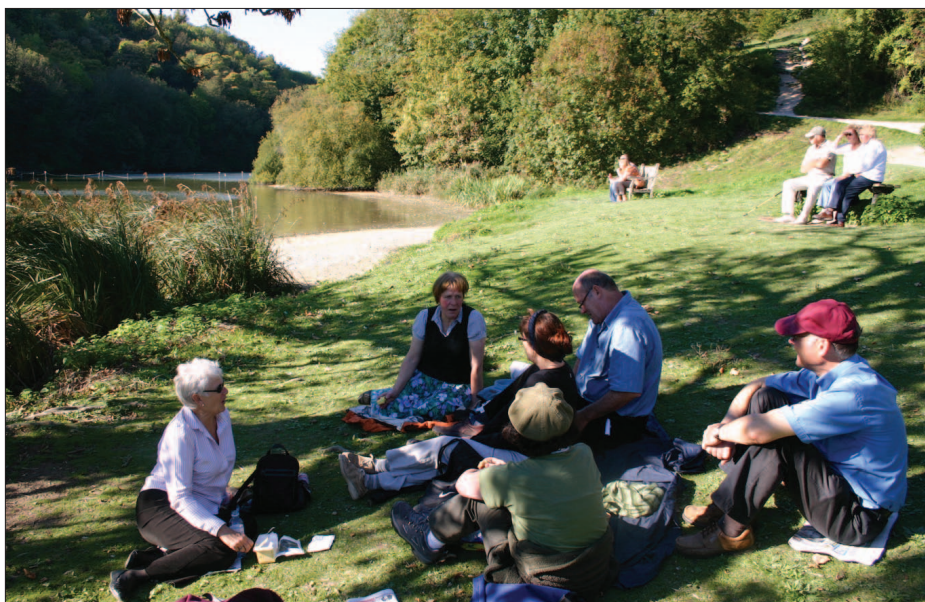
Enjoying a beautiful day for the Continuity Walk on the grounds of Arundel Castle.

ARUNDEL is an enchanting place, set in the Sussex Downs, and it has never looked more beautiful than it did on the day that the Catholic History Walkers arrived in early October.