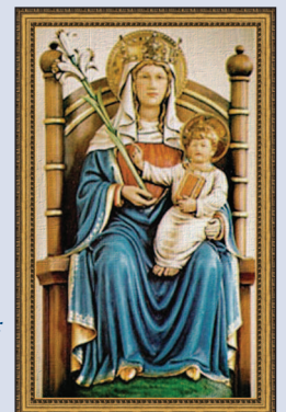
Our Lady of Walsingham, pray for us

For subscription information contact the CONTINUITY office. Subscriptions are free to CONTINUITY members but we suggest a donation of £15.00 annually to help us defray production expenses. If you feel inspired to do a standing order, we would be truly grateful.